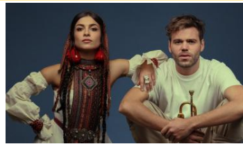
Armenia LADANIVA - Jako